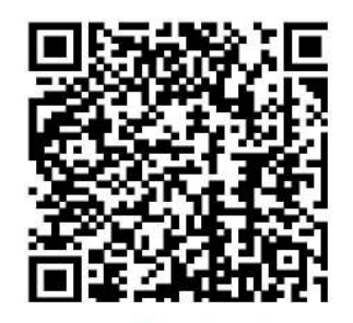
Photo ID & appointments required. No one under the age of 16 permitted onsite. There is no deferral from donating if you receive the COVID vaccine. See our COVID-19 safety measures.

Book your one hour appointment today!! Visit Schedule.BloodworksNW.org or scan the QR Code.