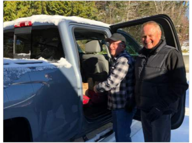
Feb 2019 snowstorm put our systems to the test as we reached out to this tight knit community for help supporting the needs of the Island in an emergency.