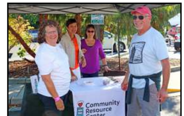
National Night Out event was hosted at the Camano Center for the first year.