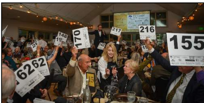
Annual Gala Auction