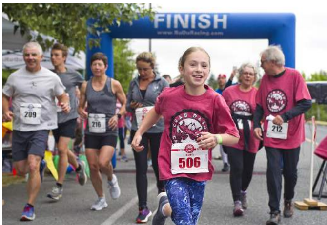
The Camano Crab Dash 5K/10K fun run/walk is a fun family pet and stroller friendly event that offers a moderate 5K that participants can run or walk and a challenging 10K run. 250 Participants ranged from 5 years old to 85 years old with even younger children riding in strollers.

As 501c3 non-profit organization, the Camano Center is 100% funded by local donors, members, businesses, and our 2 nd Chance Thrift Shop. With this financial support, the Camano Center continues to serve the needs of Camano Island and our surrounding community. We strive to make our programs both available and affordable for everyone.