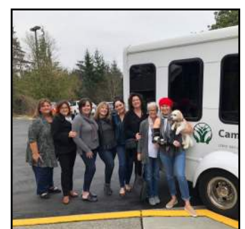
Camano Center Charters