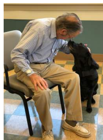
The Camano Center Adult day Program provides a break for caregivers