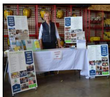
New Ambassador Program