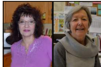
Camano Center partners with Senior Services of Island County to bring a nutrition program, Meals on Wheels and information and assistance to Camano Island seniors.