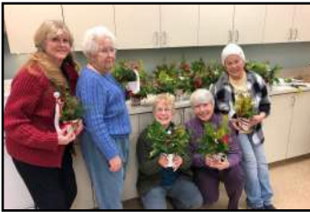
Down to Earth Gardeners prepare holiday bouquets for meals on wheels clients

The Camano Center connects, enriches, and supports our community.