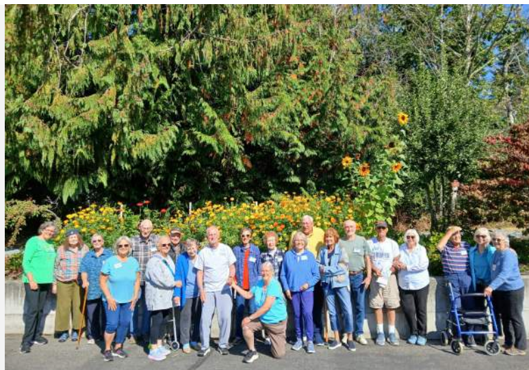
Our Camano Friends Club enjoys a warm early fall day!

Camano Center at (360) 387-0222 to schedule a time to stop by for a visit to see if the Camano Friends Club is the right match for you and your family member. Club days are on Tuesday and Thursday. Visit or check our website for more information at camanocenter.org